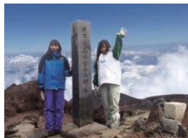
Mt. Fuji Summit