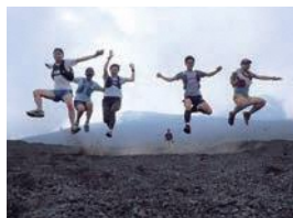
Big Sands Running