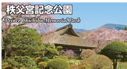
秩父宮記念公園 Prince Chichibu Memorial Park