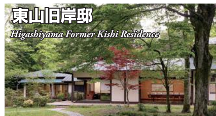
東山旧岸邸 Higashiyama Former Kishi Residence