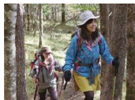
Hiking at the Base of Mt. Fuji

Mt. Fuji is much more than the summit. Several fine hiking trails start from Gotemba trail New 5th Station near the base of the mountain.