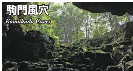
駒門風穴 Komakado Caves