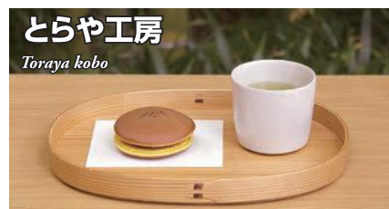
とらや工房 Toraya kobo