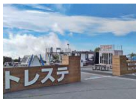
Mt. Fuji Trail Station