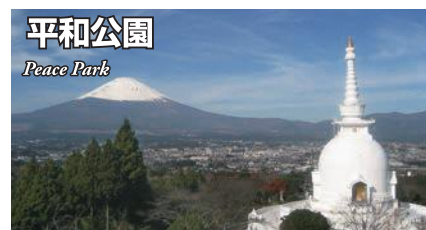
平和公園 Peace Park