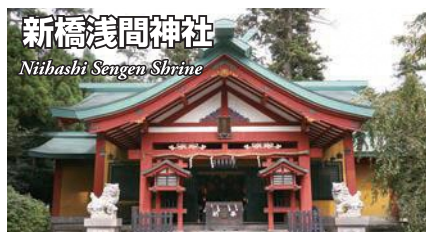
新橋浅間神社 Niihashi Sengen Shrine